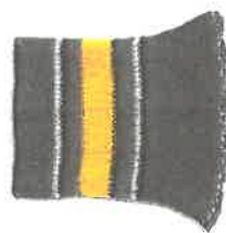
Knit Pattern #53