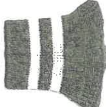
Knit Pattern #4