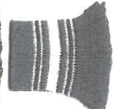
Knit Pattern #1