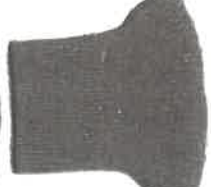
Knit Pattern Solid