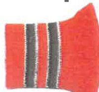
Knit Pattern #2